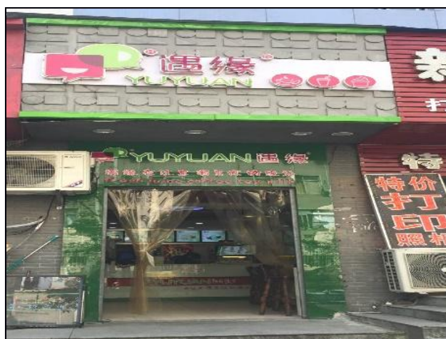
Drink store 遇缘 ( yù yu án ) is near foreign student