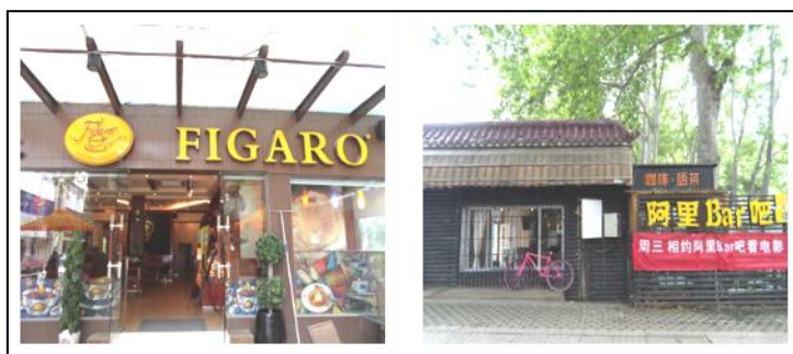
Those places are in the engineering campus