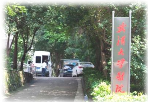
Humanities Quarter Hospital- located opposite the Bank of China