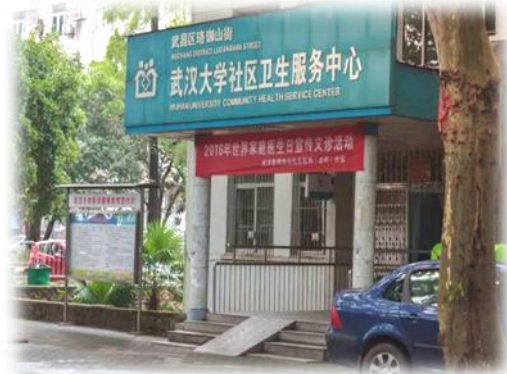
Science Quarter Hospital - located next to Shiji Square