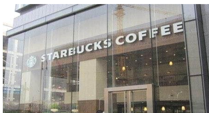
Wuhan University is surrounded by three STARBUCKS in three different locations: